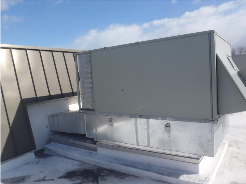
Roof top Unit