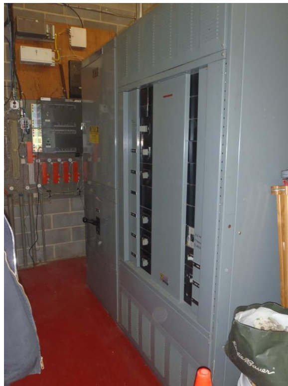
Electrical Distribution near gymnasium.