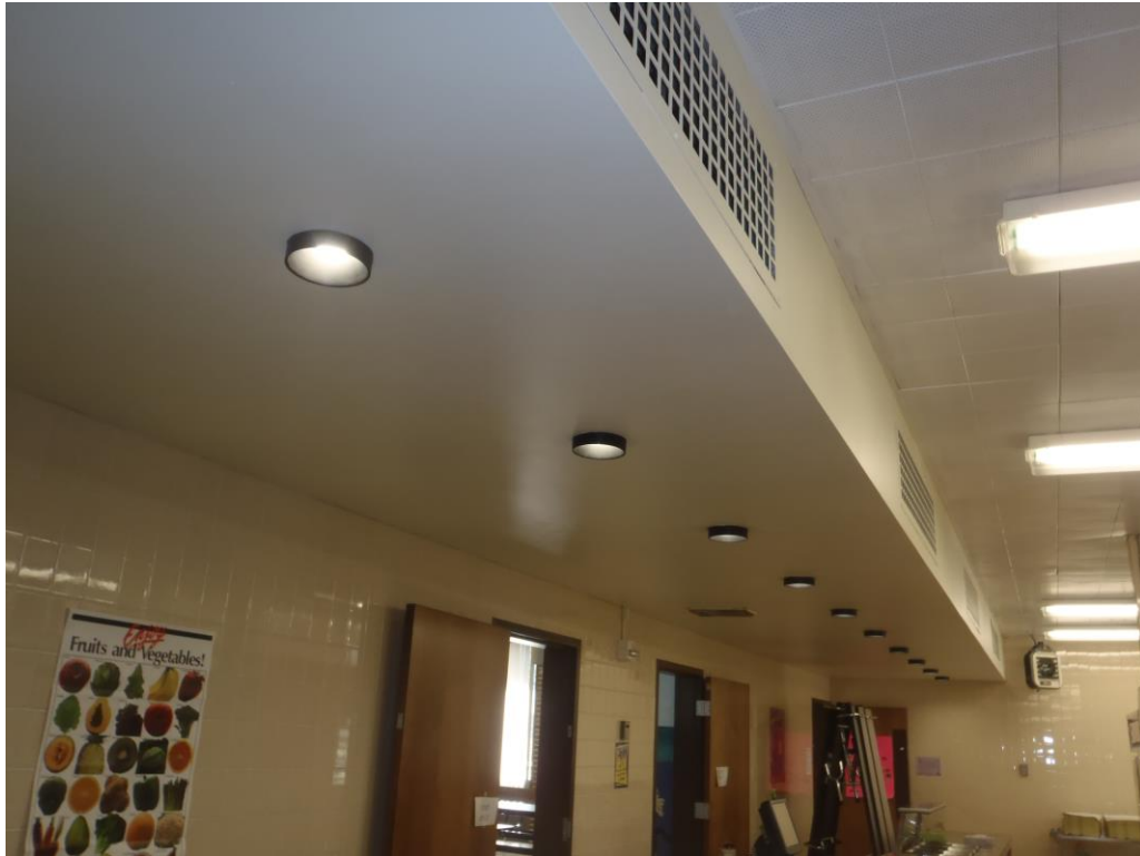
Typical duct system