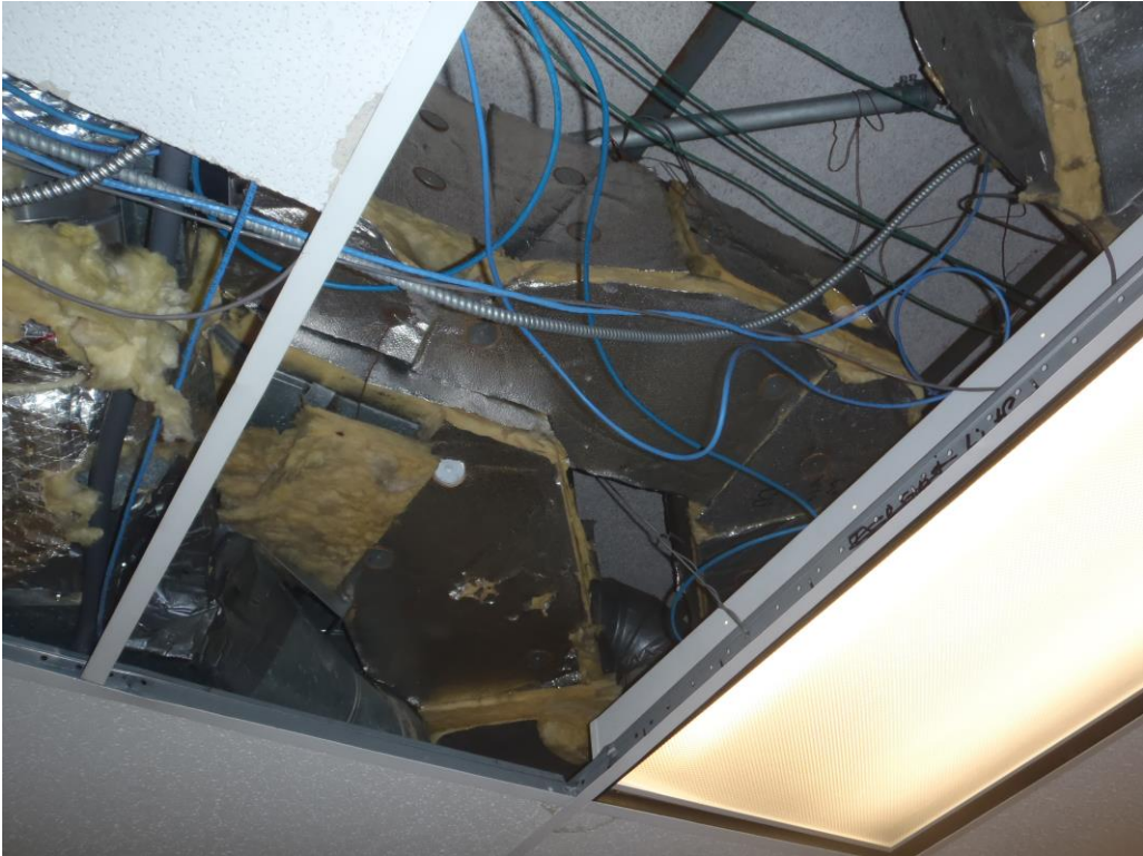
Space above ceiling tiles.