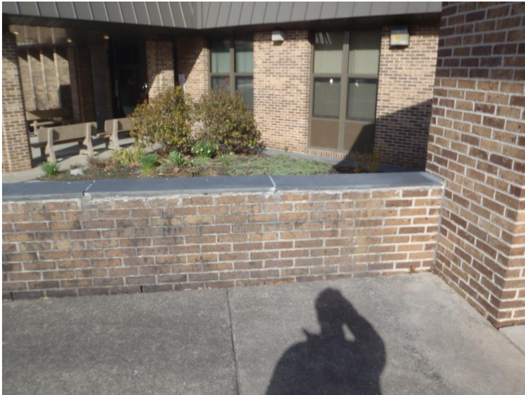
Walled courtyard looking towards main entrance