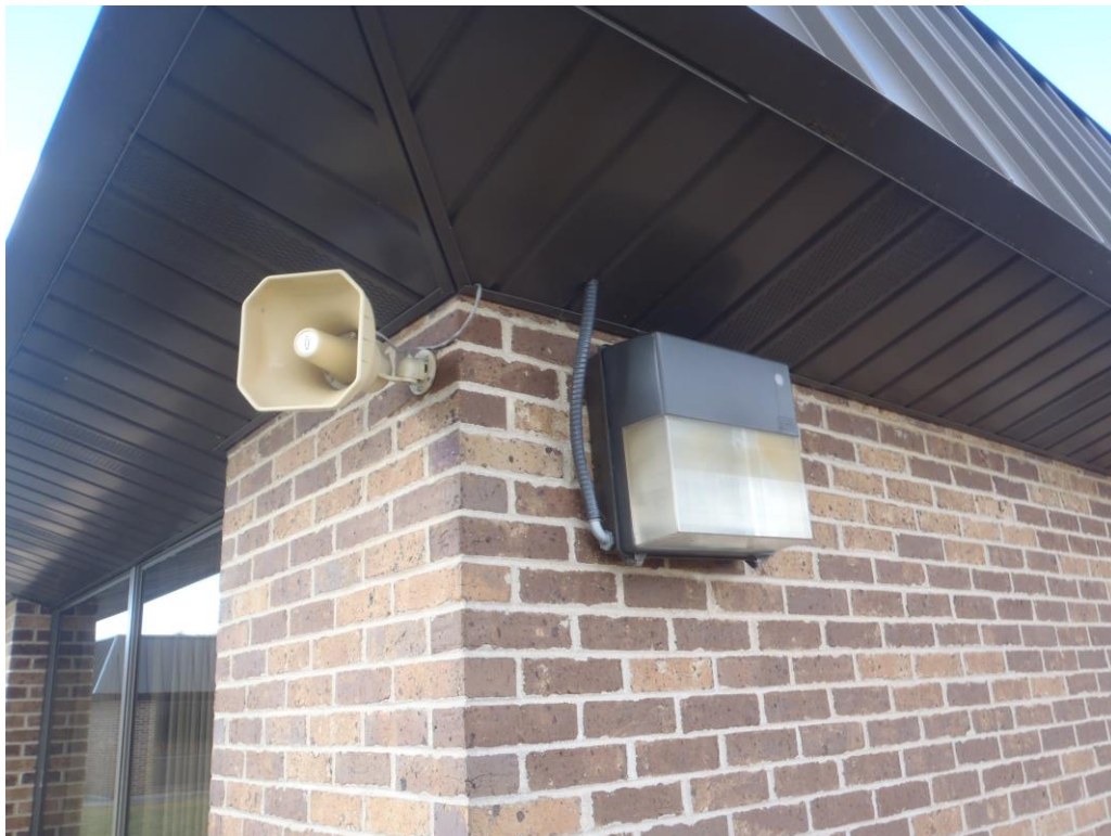
Typical wall pack lighting and public address system.