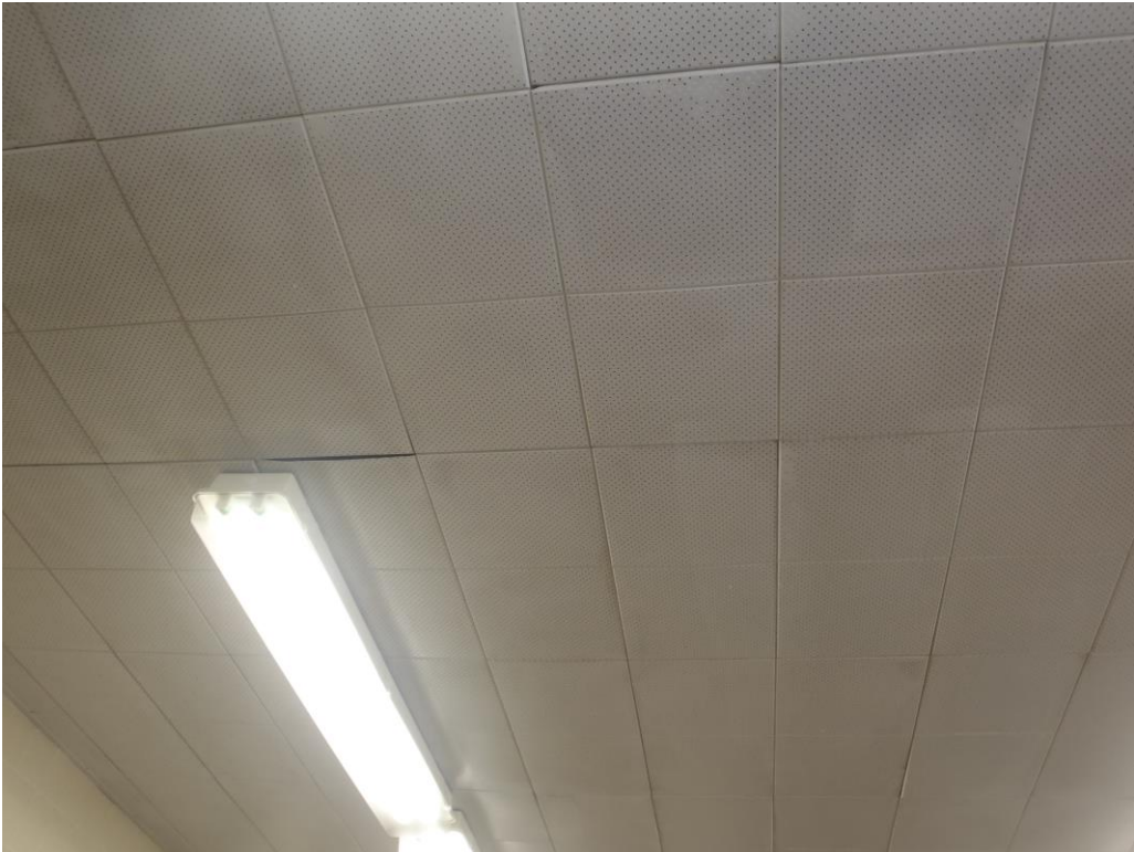
Ceiling grid in kitchen.