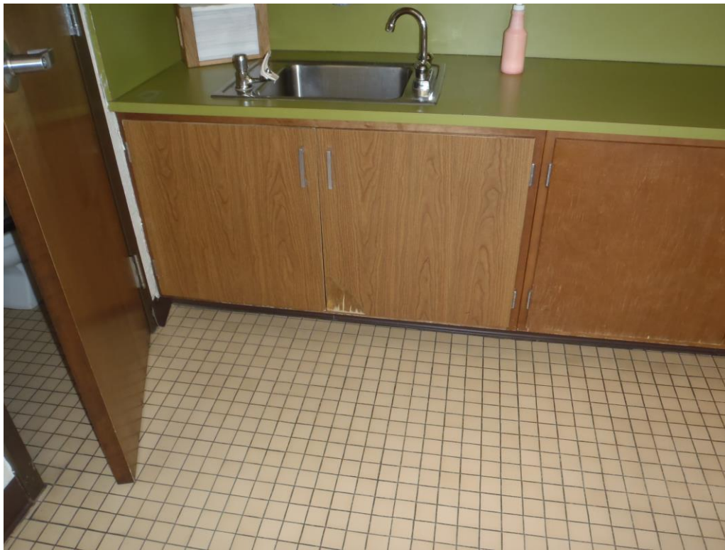
Typical classroom cabinets and sink. Note peeling veneer on doors.