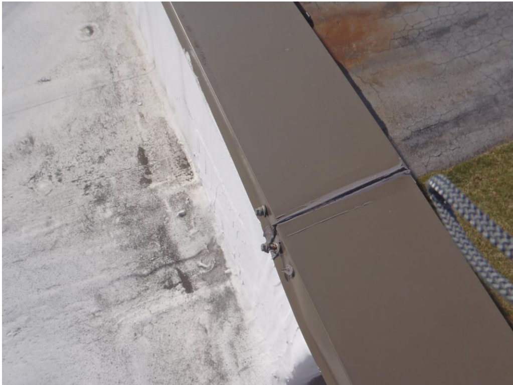
Joint in parapet capping