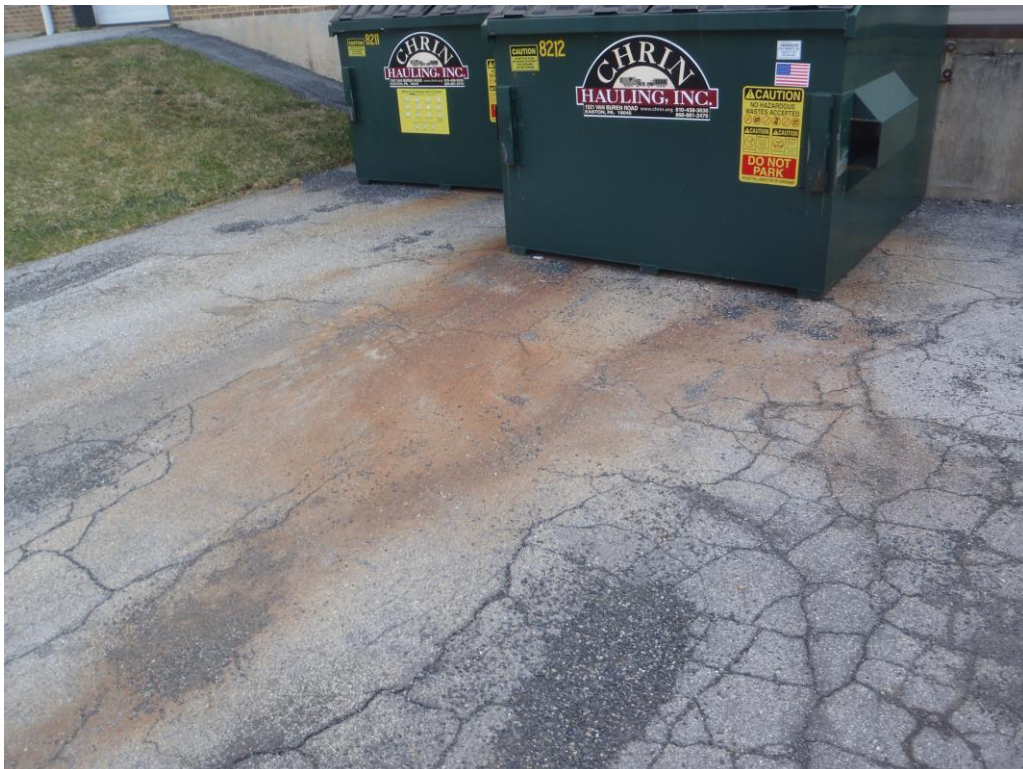
Asphalt near dumpster/loading area. BIA recommends a reinforced concrete pad to withstand the loading in this area.