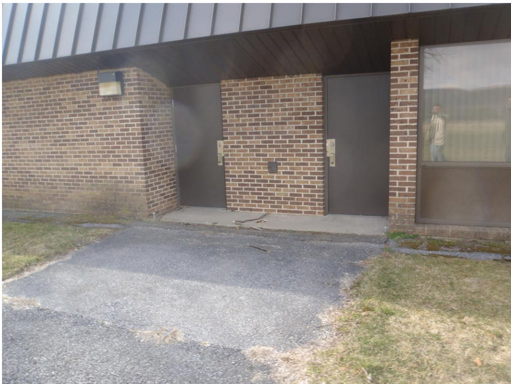
Egress from classrooms at rear of school.