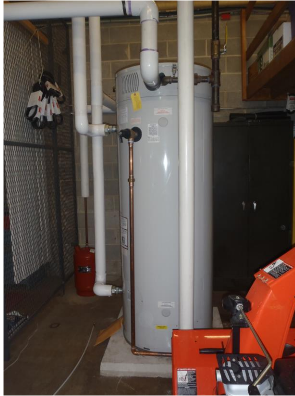
Hot water heater