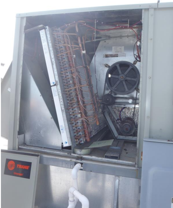
Inside of Roof Top Unit