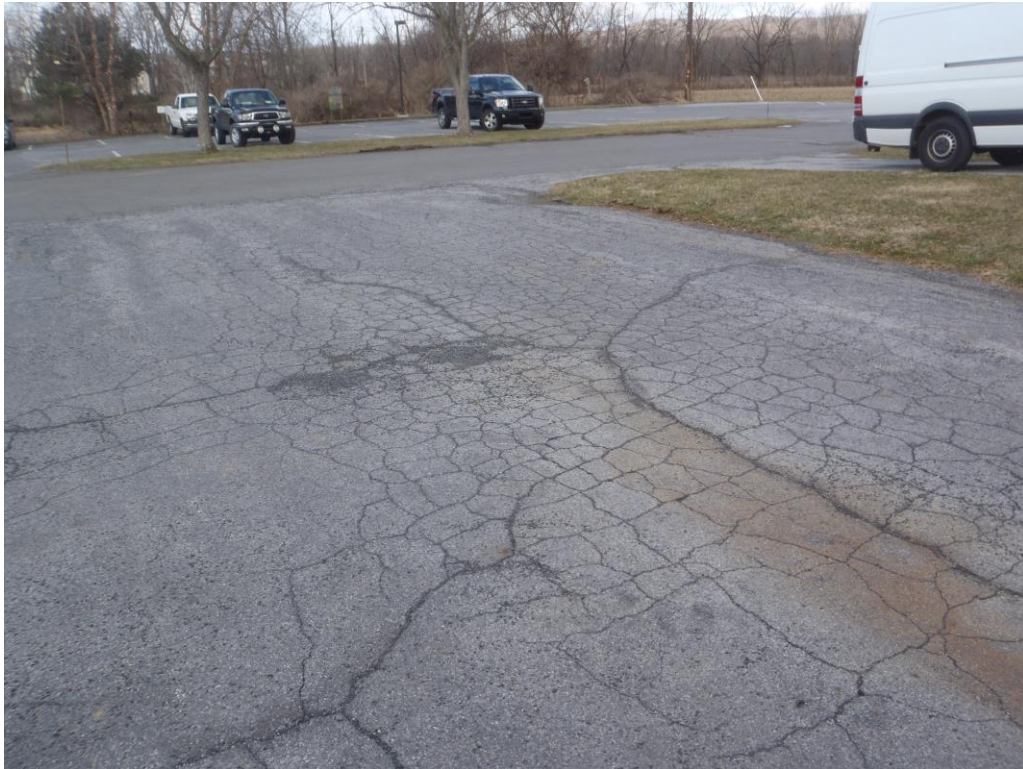
Asphalt Paving, typical