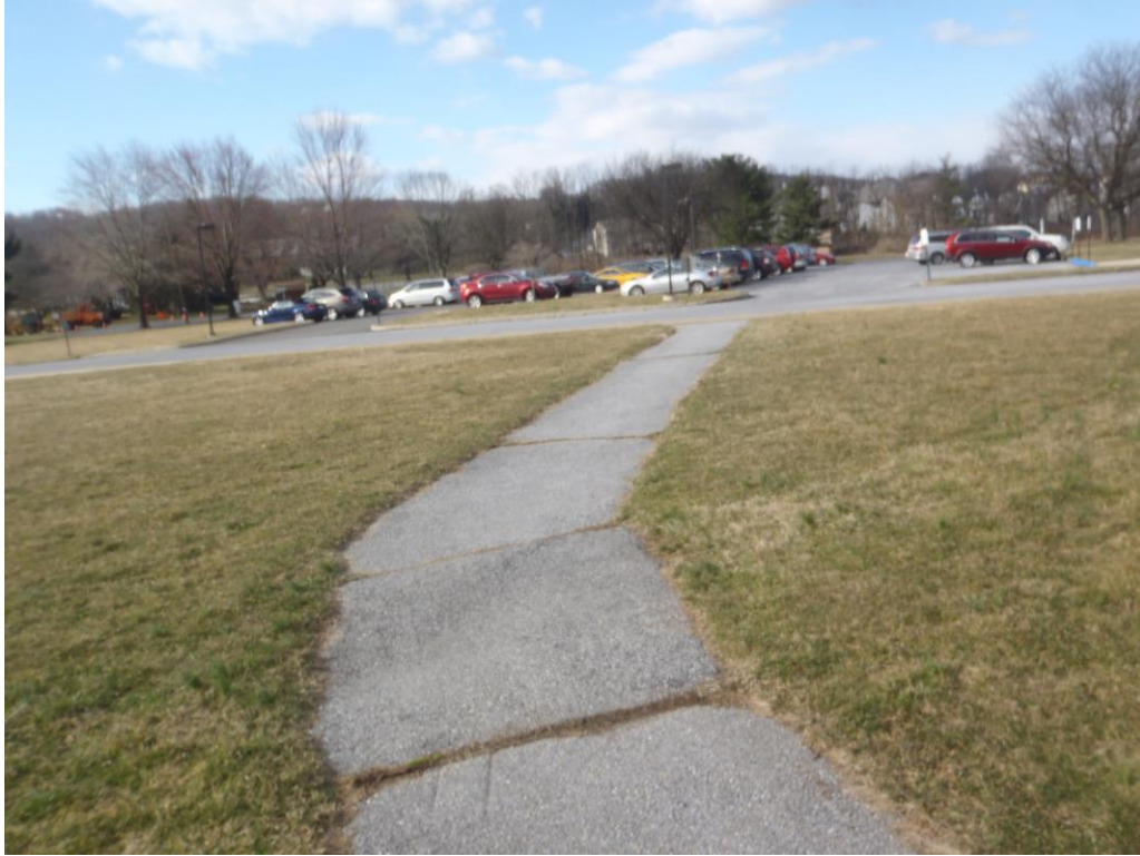
Exterior pathway, typical