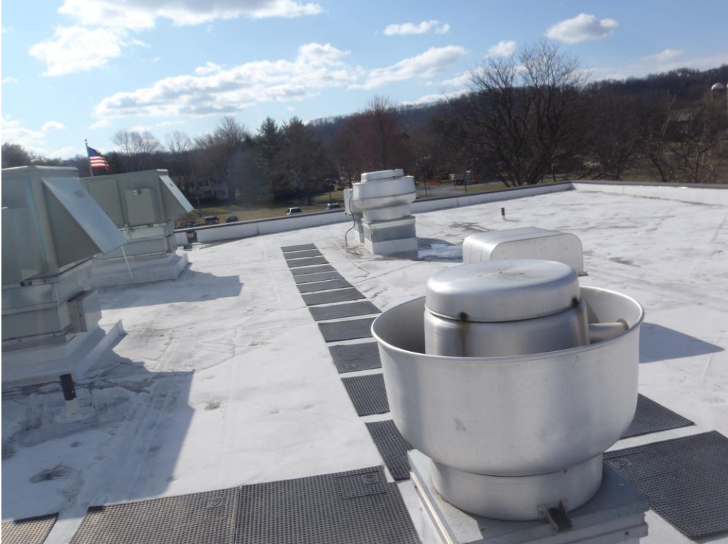
Roof top units