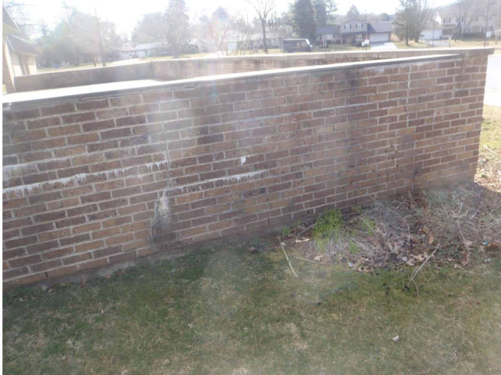
Deteriorated site wall at courtyard near main entrance.